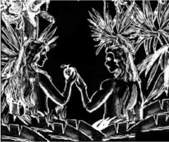
God gave Adam and Eve the freedom to choose to love Him.

choose to turn away from Him. But even then, His love and the results of our wrong choices do not always help people to put away sin and come to God. Free will is wonderful. We could not be human without free will. But it is so sad when people use free will to make bad choices.