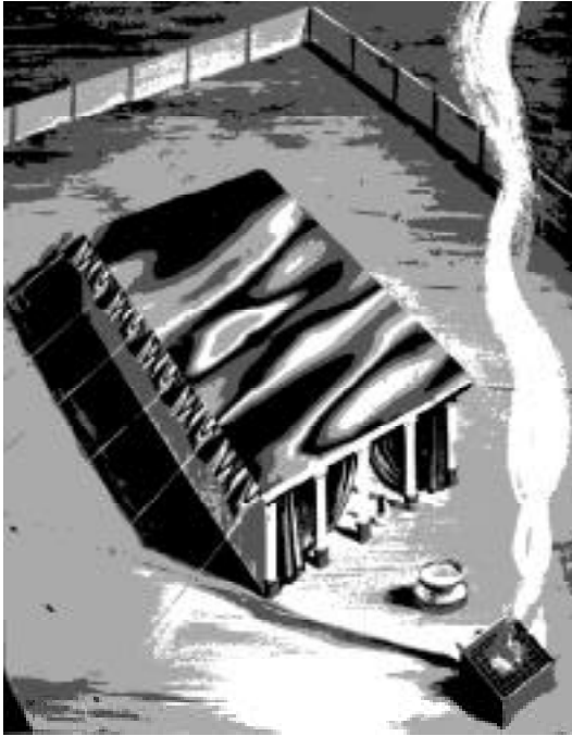
The earthly sanctuary was a symbol of the heavenly sanctuary.

Why do you think Paul tried to point out that the heavenly sanctuary is real? Why is it important for us to understand that the heavenly sanctuary is real?