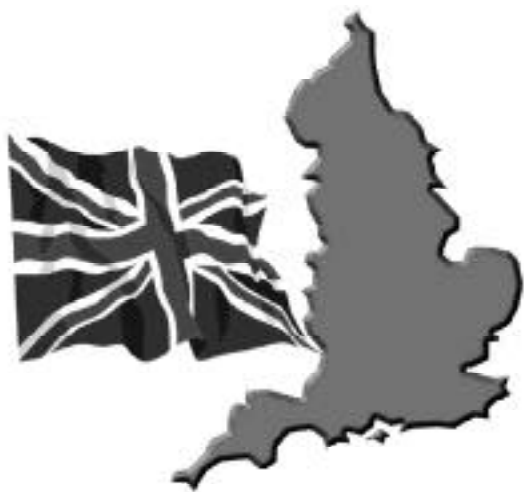
England's flag is a symbol of England.

As do other books of the Bible, Hebrews uses typology. In typology, a “type” is a real person, event, 6 or system designed by God to prefigure (be an example of) and predict 7 someone or something greater and more real. This something or someone greater is the “antitype.” Types are symbols of things or people greater than the symbol itself. For example, a national flag is only a symbol of a nation. A nation is greater than its flag. The Hebrew Bible is filled with types. Many types find their fulfillment in Jesus. Jesus Himself is greater than all the types that were an example of Him.