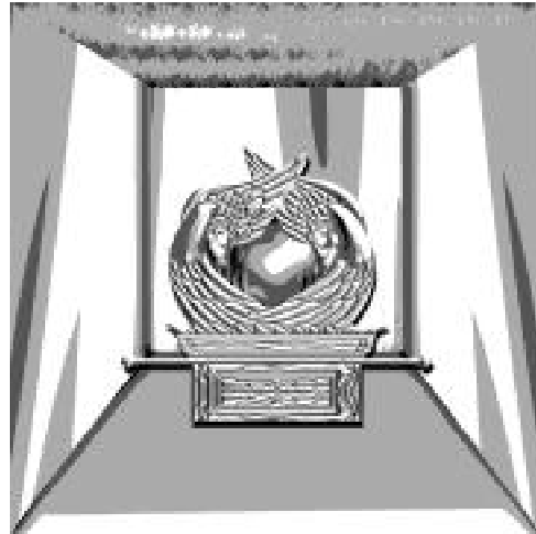
The Most Holy Place.

The most common phrase used in Hebrews for the sanctuary both in heaven and on earth comes from the Greek word ta hagia , meaning “the holies,” “the holy places,” “the holy things.” Another way this phrase is written is hagia hagion (“the holy of holies”). Hagia hagion is only used for “the Most Holy Place” (Hebrews 9:3).